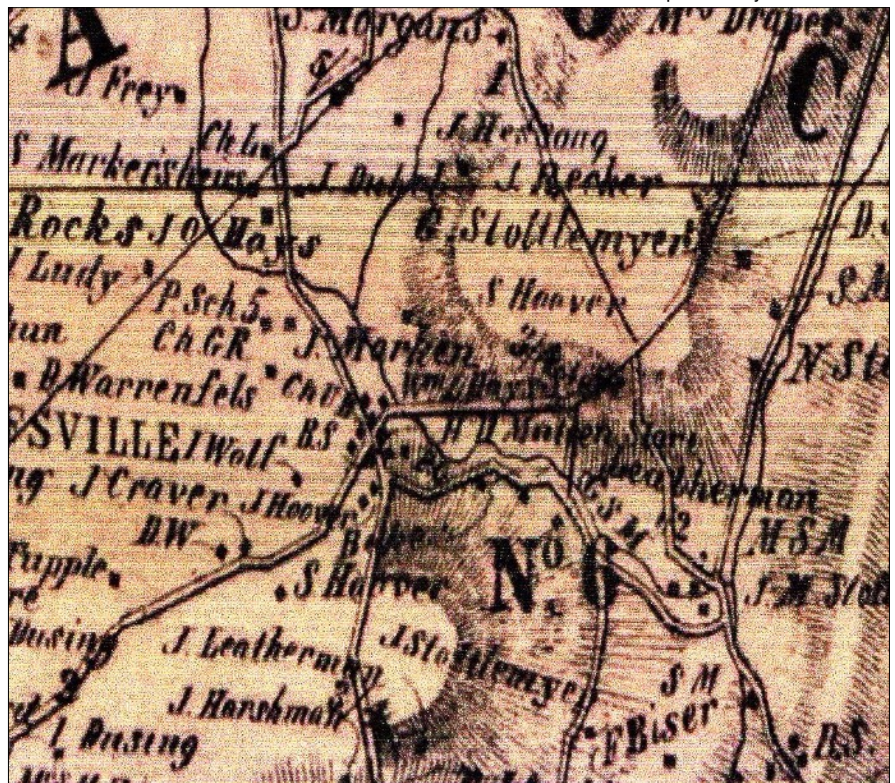
Wolfsville area from 1858 Bond Map