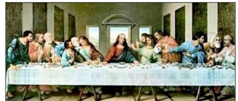
Leonardo da Vinci (Italian, 1452-1519) Last Supper (1495-98)

Jesus will then proceed up the aisle and take His place at the table. Once Jesus takes his place, Jesus and the apostles will go into a