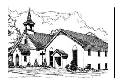
Salem United Methodist Church — Wolfsville