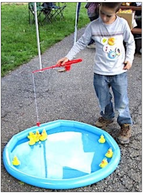
This year's Lord's Acre included an expanded area for children's activities, including a Ducky Pond, Coin Toss, and Bean Bag Toss, with prizes for everyone who played.

The crowd was entertained with Christian music. Music with a Christian message is an