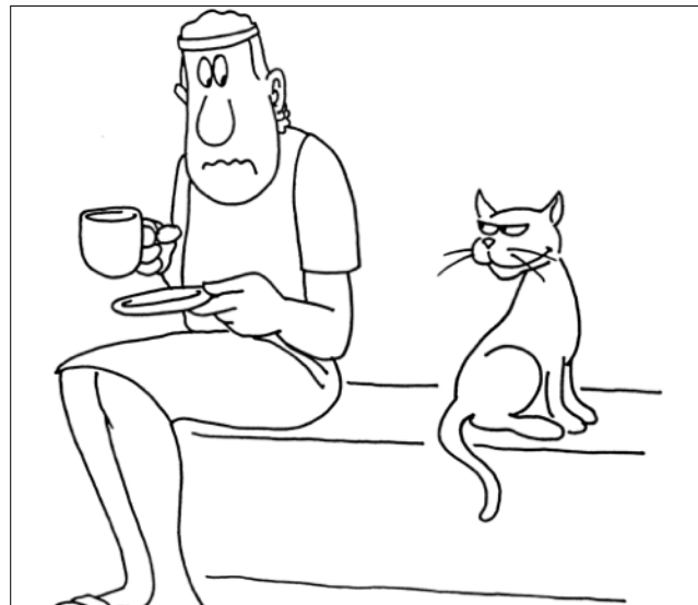
Daniel was never again comfortable around cats — of any size. (See Daniel 6:16)