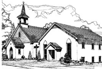
Salem United Methodist Church — Wolfsville