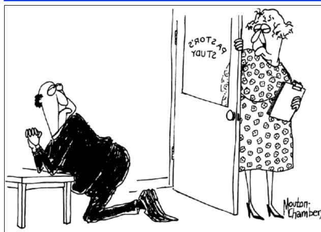
"Oh, good . . . you're not busy."