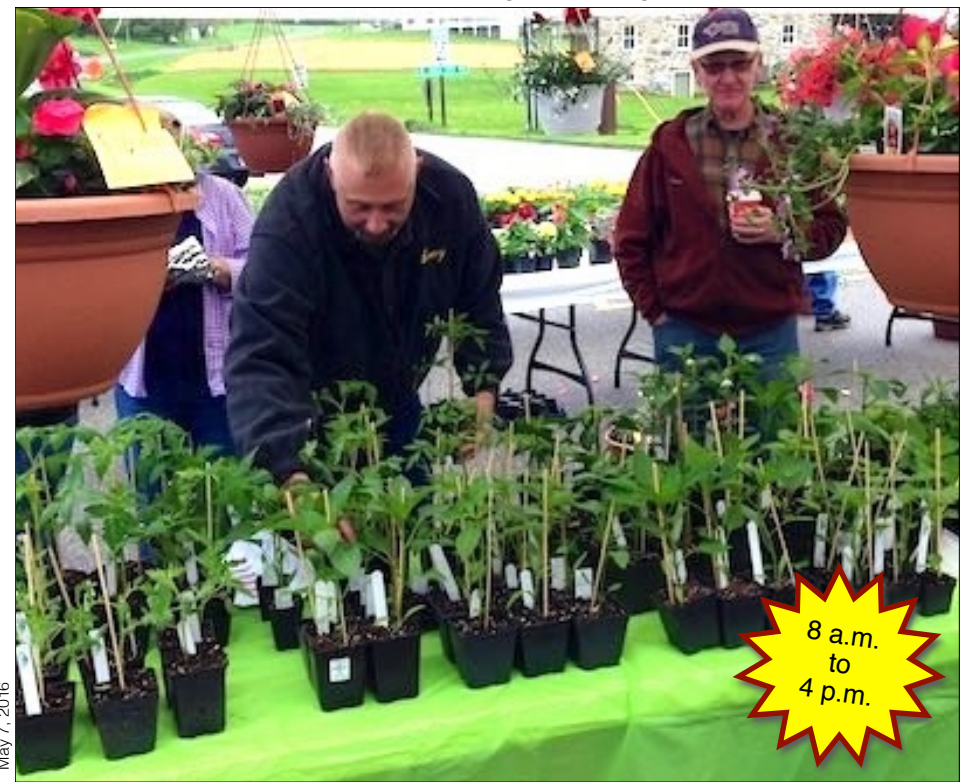
May 7, 2016