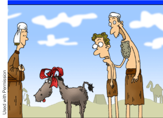
Used with Permission

Once you get your permit, learn to ride, and prove yourself responsible, we can discuss moving up to a camel . . . Happy Sixteenth Birthday, Bud.