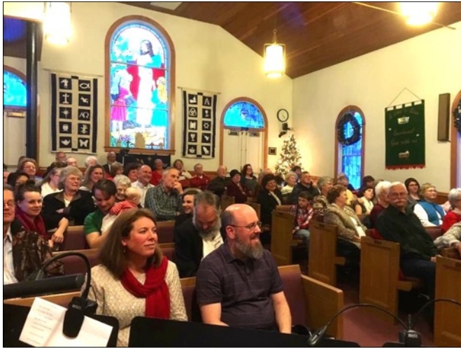
December 4, 2016 — A large crowd attended the Christmas Sing-Along at Mt. Bethel United Methodist Church. Special guests were The Catocin Mountain Boys and Works in Progress Praise Band.