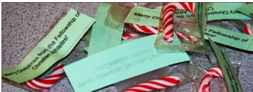
Candy canes ready to distribute to Middletown High School students.