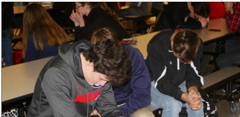
Fellowship of Christian Athletes' members open their meeting in prayer.

In conclusion, I will share with you Joshua 1:9: "This is my command - be strong and courageous! Do not be afraid or discouraged. For the Lord your God is with you wherever you go."