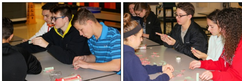
Fellowship of Christian Athletes' members work on their candy cane activity.