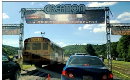
Entering the Creation grounds.

The youth were exceptional as they helped pack up our camp and have