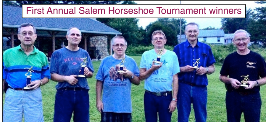
First Annual Salem Horseshoe Tournament winners