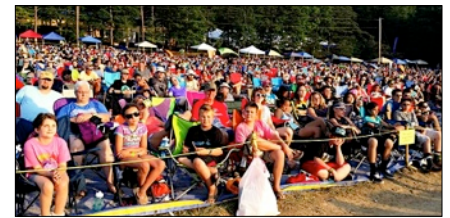
Salem has a great front row spot. All eyes on the main stage.