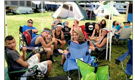
Relaxing at the campsite.