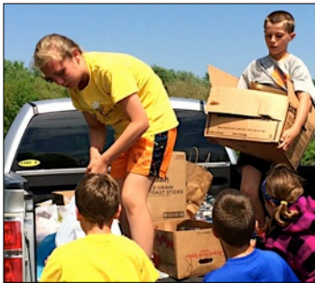
Wolfsville Elementary Donates Food to Food Pantry page 10