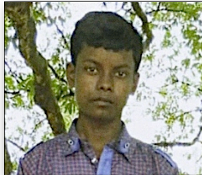
Compassion International Santanu Sing East India $38 monthly