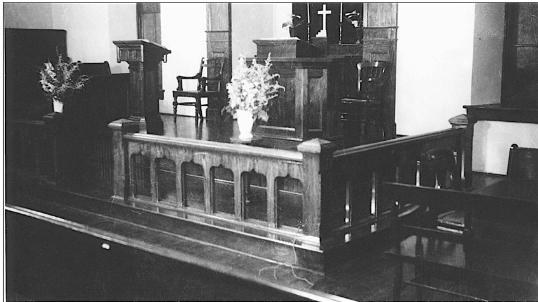
Salem sanctuary before 1948