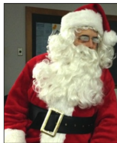
Santa at last year's party

You are invited to the annual Salem Christmas Party to be held at the church on Saturday, December 6, at 5:30 p.m. Come together as a church family for an evening of fellowship and outreach to the community. A potluck dinner will be enjoyed by all. Please bring a side dish or dessert to share. Fun activities are being planned for the children. All ages will be playing the exchange game — bring a wrapped gift under $5. There will also be a visit from Santa and caroling.