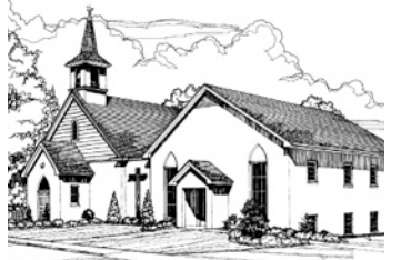
Salem United Methodist Church — Wolfsville