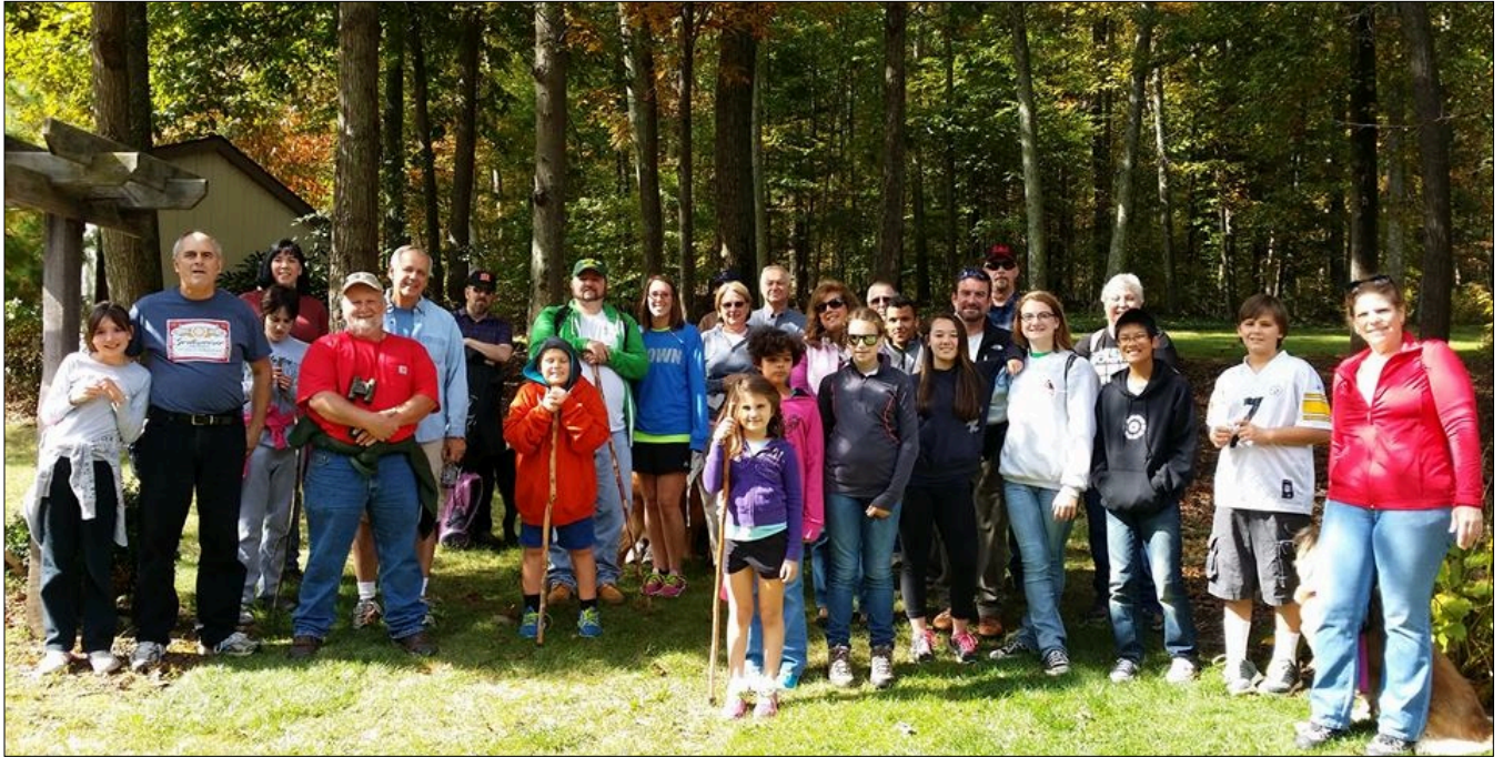
27 people, 3 dogs and 1 cat (in a backpack) made the hike to the top.