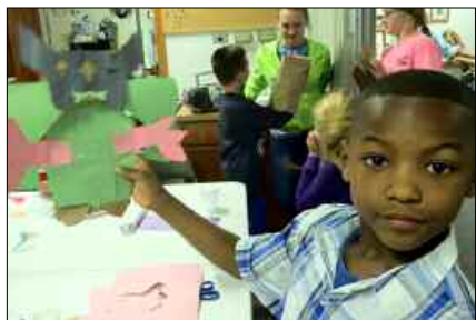
Hero's Club student is proud of his craft.