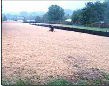
Cemetery rock removal project completed and disturbed area has been seeded.