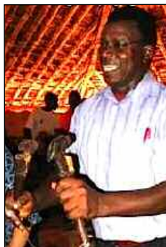
Pastor playing the anzoro

After Congo I will be heading back to Uganda and then on to Kenya before going to another central African country for another music workshop as well as to see the work going on up there. When I