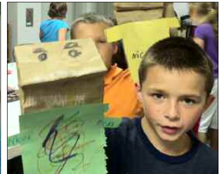
At craft time, Hero's Club children were asked to make an image of John the Baptist or Jesus Christ, who they learned had helped to spread the good news.