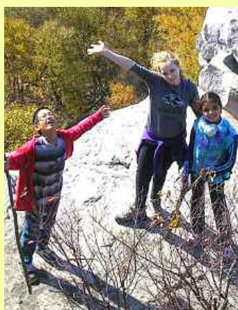
Hike to Black Rock More photos on page 9