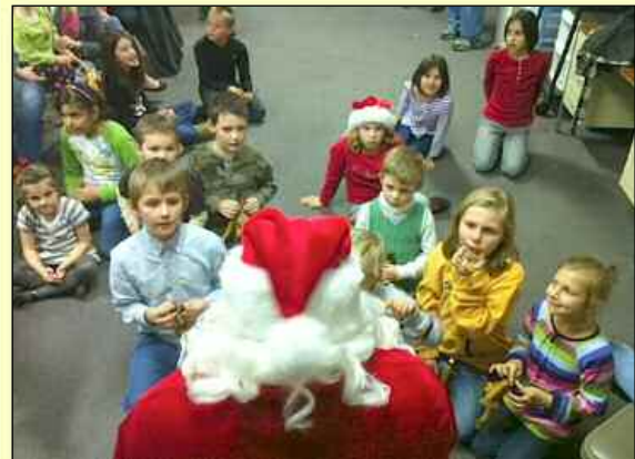
Santa will attend Salem's Christmas Party with a special Christmas message about the "real reason for the season, the birth of Jesus." [Photo from last year's party.]

A highlight of the evening for children and adults alike will be a special return appearance by the jolly man in red. Santa Claus has agreed to take time out of his busy schedule to visit Salem, meet with the chil-