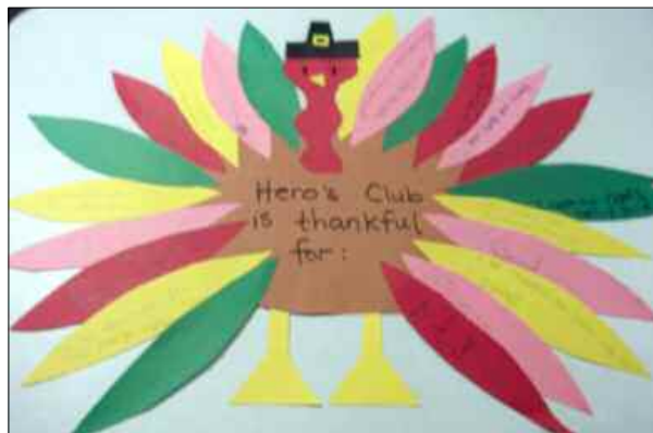
The Thankful Turkey— each child filled out a feather with what they are thankful for.