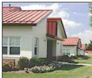
Board of Child Care Falling Waters Campus