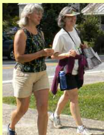
Great CROP Walk! Details on page 4