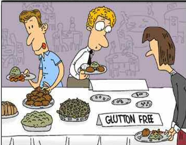
The potluck dinner at the church was very well organized, right down to the signage. Spell-check might have helped.