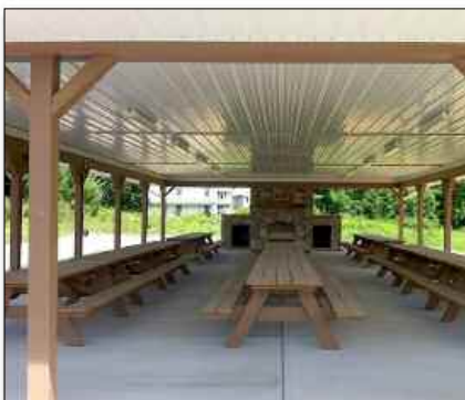
Picnic tables perfectly placed in the pavilion. Stone fireplace at the end.