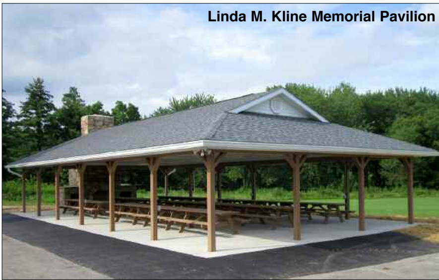
Linda M. Kline Memorial Pavilion