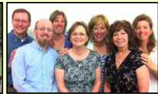
Works In Progress Contemporary Praise