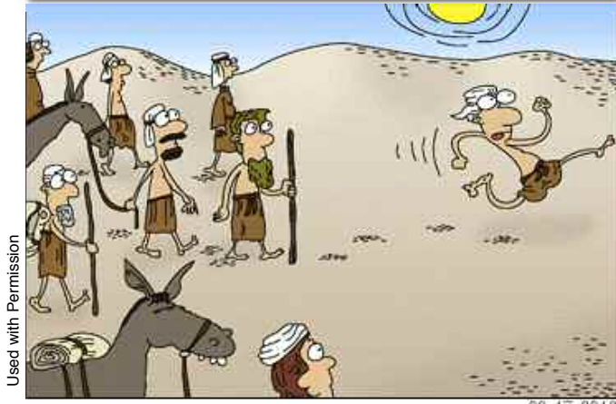
Used with Permission