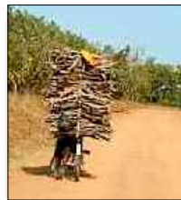
Men bike loads of wood, charcoal and produce 30km into town to sell. Oftentimes the loads of wood are taller than they are!