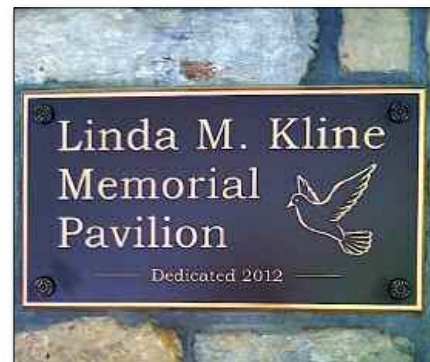
The memorial plaque is located above the fireplace mantle.