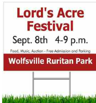
Look for these yard signs at intersections around the Wolfsville/Myersville area.

Salem's Lord's Acre Festival, which began in 1960, was first held in the old Wolfsville School where Salem's parsonage now stands. In 1970, the festival was moved to the Wolfsville Ruritan Park where it has grown to what it is today.