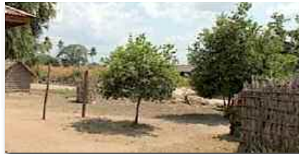
A Tanzania village.

"That's the end of the story!?" she exclaimed. "That's the end of it for tonight. Another night I will come and tell you what happened next." She laughed and said I do that to her every time – I start the story and then tell her I will come back with the next part later... but I have to do that, because the story is too big and too