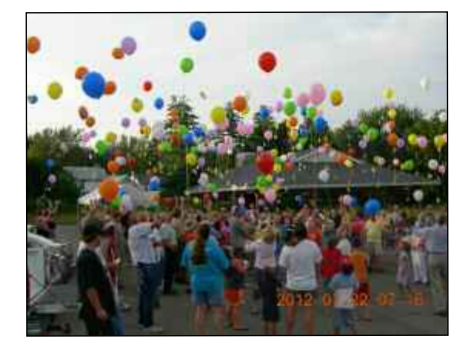
After a count of 1-2-3, 200 balloons with their cards headed skyward.