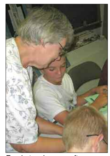
Fonda teaches a craft.