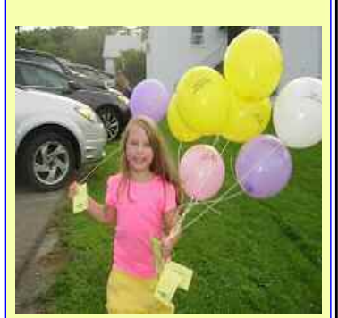
Ice Cream Social and Balloon Launch More Photos on page 11