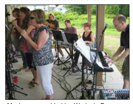
Music was provided by Works in Progress Community Praise Band.