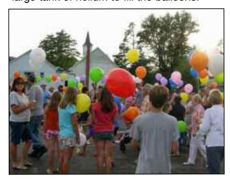
The crowd assembles on the parking lot to receive instructions about the launch.