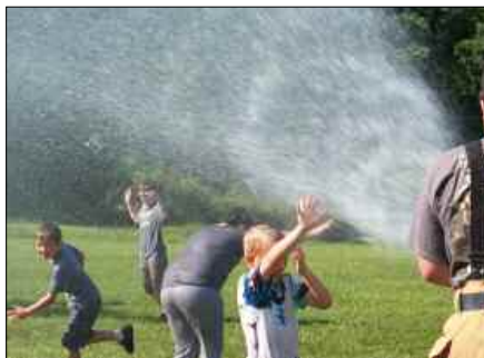
The Wolfsville Volunteer Fire Company came to Hero's Club for the end-of-year party. The kids enjoyed running through the spray from the firemen's hoses.