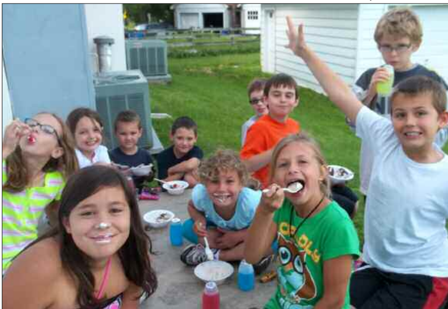
Hero's Club children enjoy the end-of-year make-your-own-sundae party on June 4.

Lives are being changed as we introduce more souls to the greatest Hero of all!