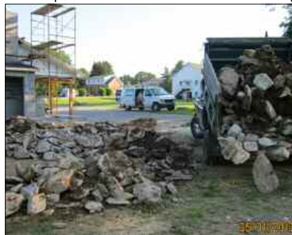
May 31, 2012