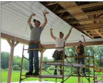
May 28, 2012

More photos at www.SalemChurchWolfsville.org