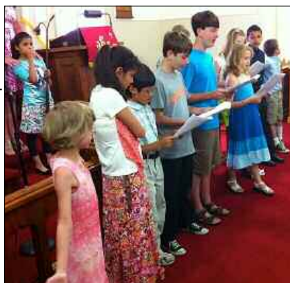
Benediction as a group