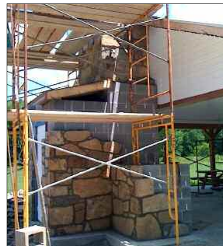
June 17, 2012