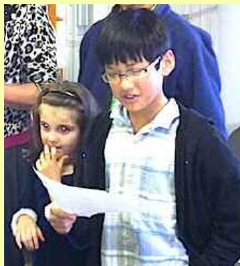
Salem's youth honored our seniors with a luncheon Details on page 3