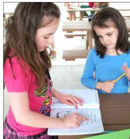
Hero's Club homework time