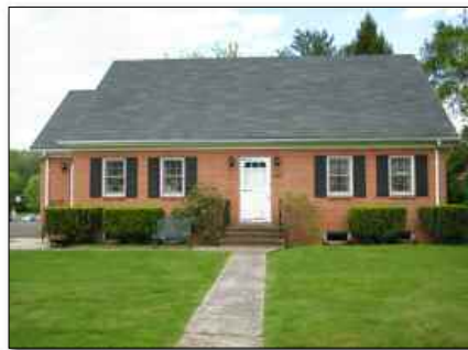
Salem Parsonage Built 1974-75

Once the system is installed, we will proceed with the insulation enhance-