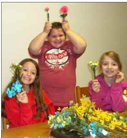
Hero's Club flower pen craft