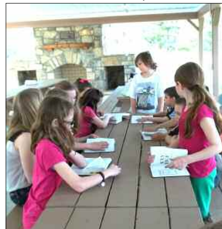
Hero's Club Bible Study