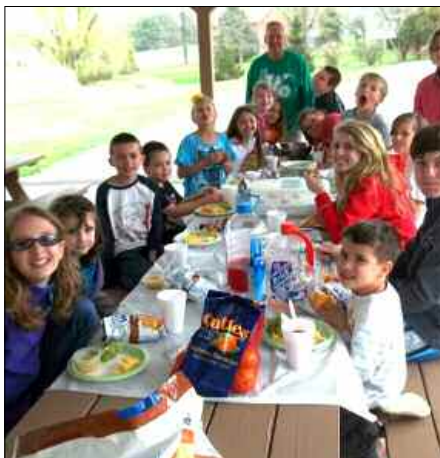
Hero's Club snack time at the pavilion