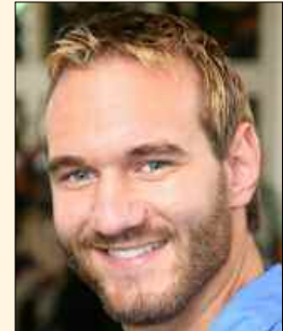
Nick Vujicic to appear at Creation 2012 LifeWithoutLimbs.org

If you have any questions, please contact me at 301-293-1470 or by email at ses1313@comcast.net .