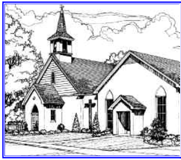
Salem United Methodist Church – Wolfsville