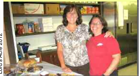
Lord's Acre 2012