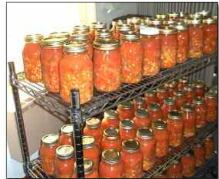
Vegetable soup in jars and stacked