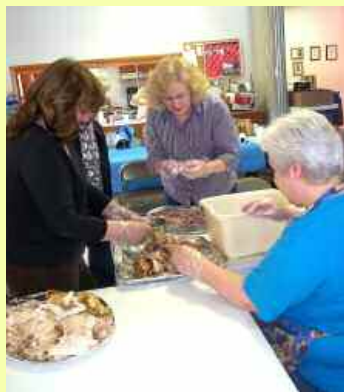
Preparing turkeys for SOUP & SANDWICH SALE Details on page 4