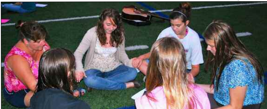
FCA members pray in the stadium during "See You At The Pole" in the fall

With the generous contributions from Salem United Methodist Church, our FCA huddle is able to do things like participate in the Adopt-A-Family program during the Christmas season; distribute candy canes with the message of Christ's