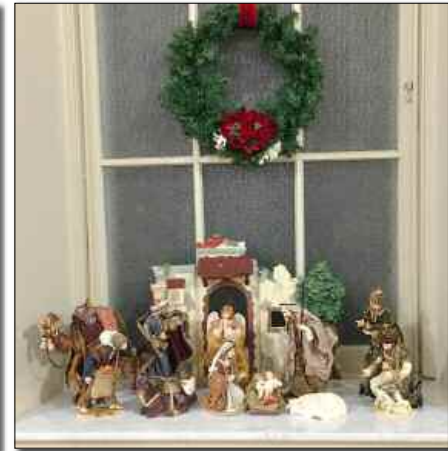
The nativity is assembled and placed in two sanctuary windows.