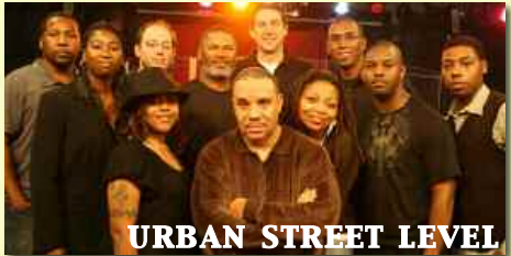
URBAN STREET LEVEL