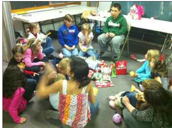
The kids arrange themselves in a circle... getting ready to play the package game.