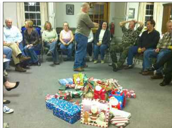
The adults are seated and ready ... waiting for the package game to begin.