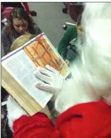
Santa reads the Christmas story from the Bible.